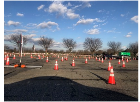
Editor's Note: This photo is NOT a BMC Autocross layout. It's a Dover Speedway Covid vaccination event.