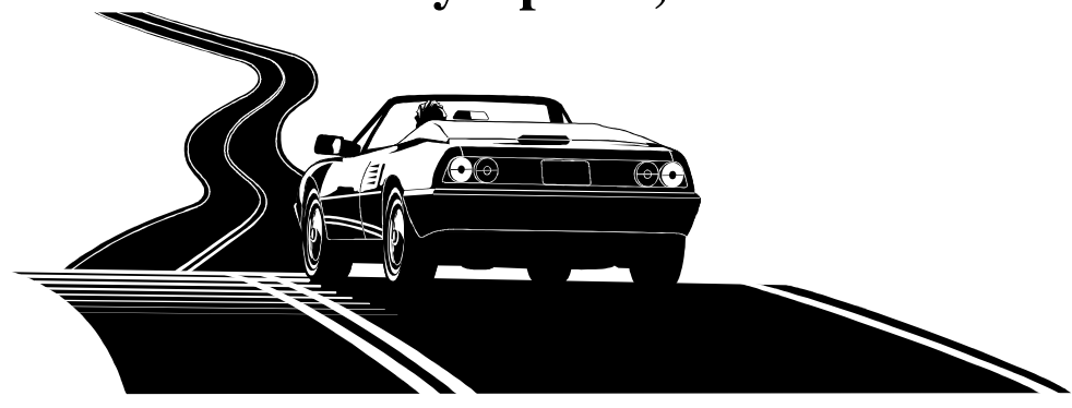
Presented by South Jersey Region – Sports Car Club of America www.sjr-scca.org

What is a Road Rally? Bring any road-legal vehicle, a friend, and come have some fun on a Time-Speed-Distance (TSD) Road Rally! This is NOT a race. The challenge for the driver and navigator is to follow directions and to attempt to precisely maintain an assigned average speed. You will encounter checkpoints along the route where your arrival time will be recorded. Arrive early (too fast) or late (too slow) and you will collect penalty points. Lowest score at the end of the rally wins. This event is safe and legal; all speeds are within the posted limits.